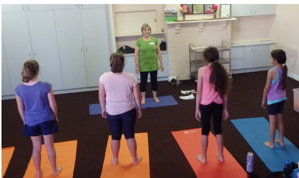
Monday night yoga sees kids and parents stretching their stuff. Give us a call on 8572 3513 if you'd like to join!

We've got a whole bunch of cool stuff planned. Find the program over the page.