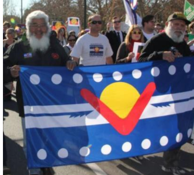
Above: Ngarrindjeri people take part in a parade in Adelaide

Ngarrindjeri people and Aboriginal and Torrens Strait Islander people are advised that this publication may contain images or content of deceased persons