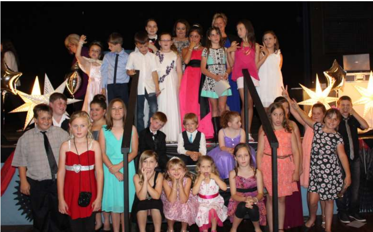
^ Mini Deb ball (age 5-12) Friday 16 January 2015

View all the photos from both events on the Taillem Bend Community Centre Facebook page