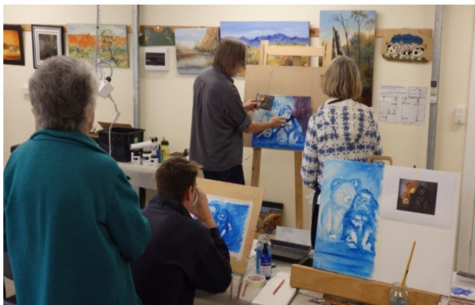
Art classes happen regularly throughout the year