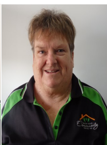
Lorraine Cresp Committee