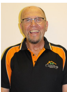
Glenn Power Committee