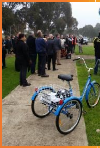
Remember free bike hire ay TBCC